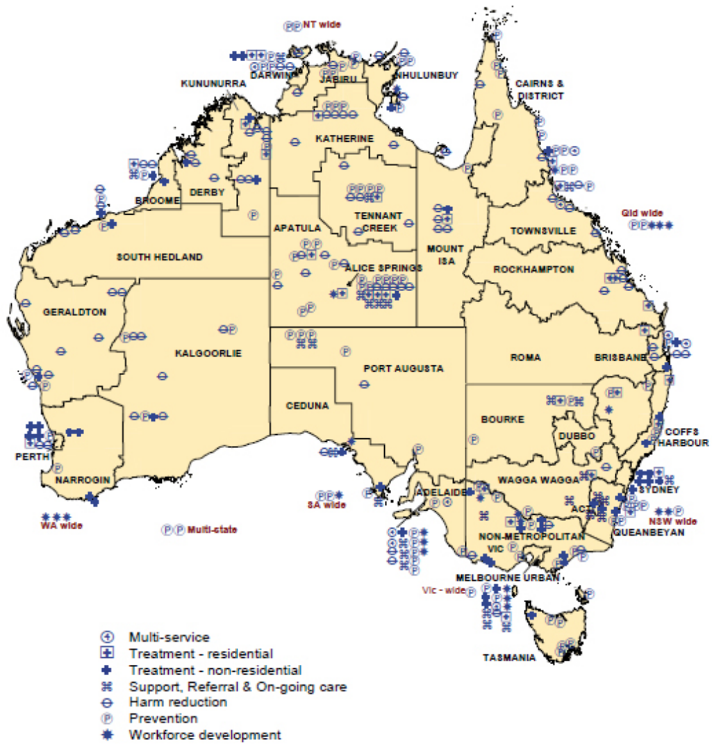
Map 2: Indigenous-specific alcohol and other drug intervention projects by ABS Indigenous region, 2006-07